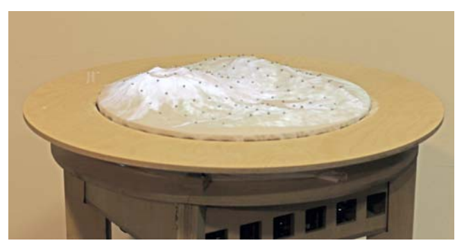
Figure 2. Relief system with pins covered with Lycra surface and top projected landscape.